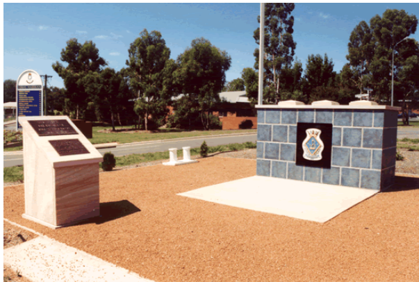
Title: WRANS Memorial HMAS Harman Type: Image Date: 3 May, 2023