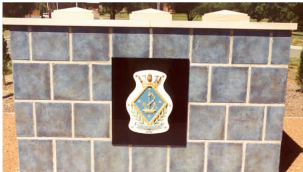
Title: AWE0566ga.jpg Type: Image Date: 3 May, 2023