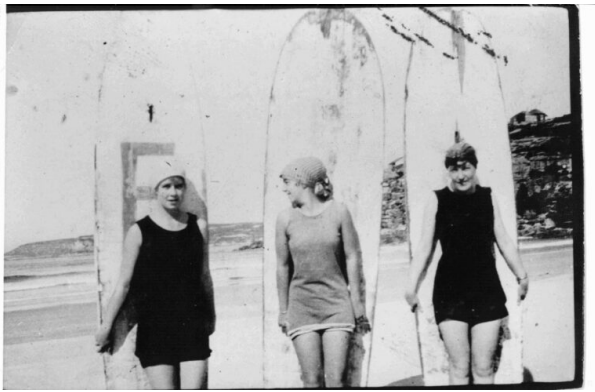
Title: AWE2231d.jpg Type: Image Date: 3 May, 2023