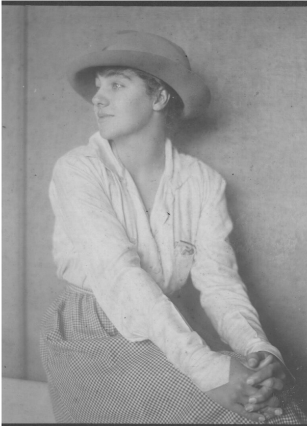
Title: AWE2231e.jpg Type: Image Date: 3 May, 2023