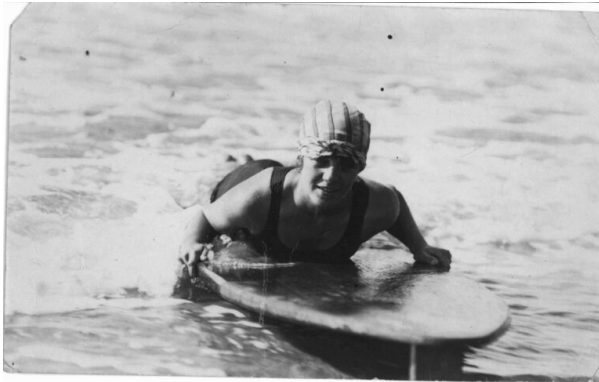
Title: Senior girls of Freshwater swimming club parading around the pool Type: Image Date: 3 May, 2023