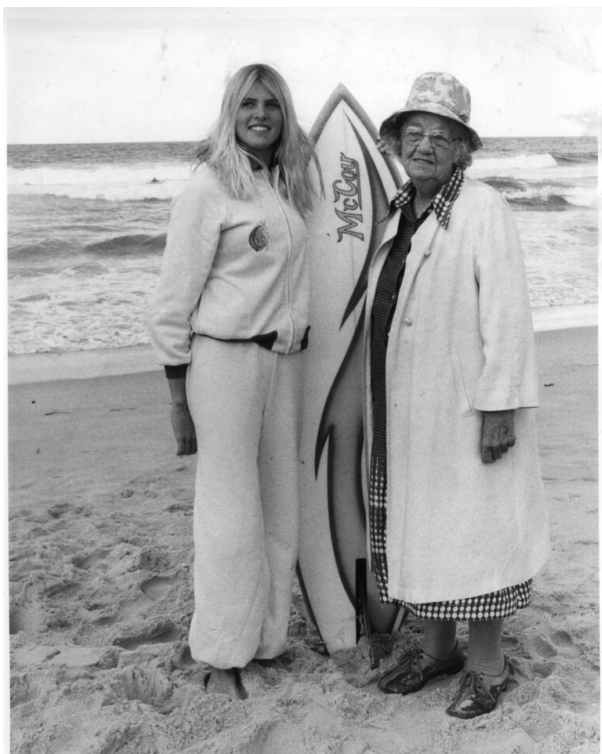
Title: AWE2231f.jpg Type: Image Date: 3 May, 2023