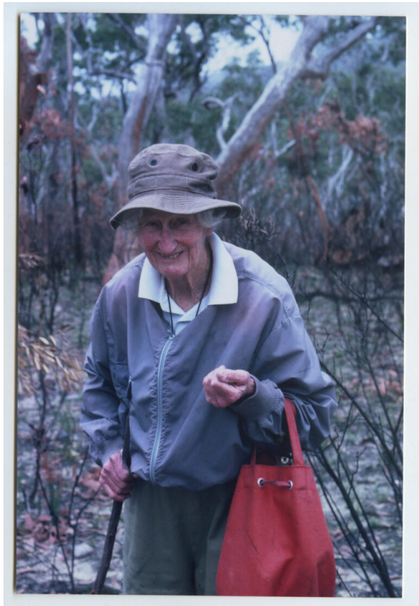
Title: Boronia deanei, Fitzroy Falls Type: Image Date: 3 May, 2023